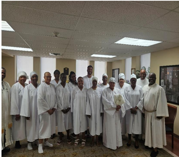
Candidates pose for group picture after receiving instructions and prayer prior to the commencing of the service