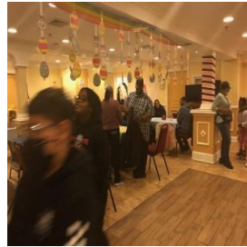
OUR GUEST FAMILIES ENJOYING THEMSELVES (children received temporary Easter tattoos when they arrived)