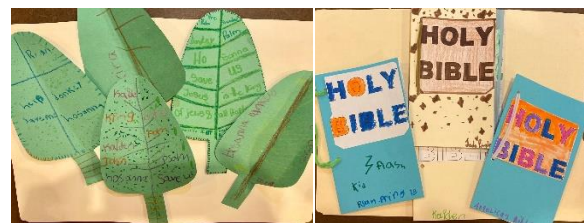
Art work & "The Holy Bible Replica"