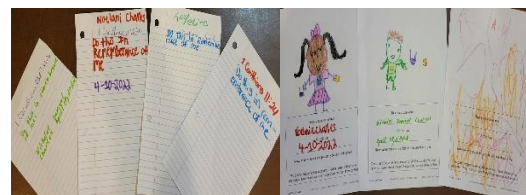
Our "Scholars" art work